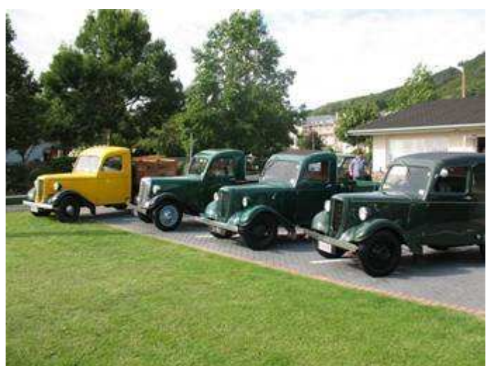
Why are they always green?