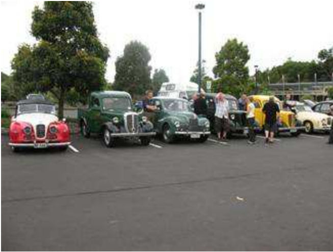
Some of us at the start