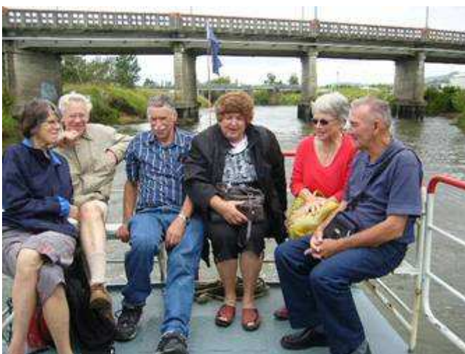
Those at the back of the boat