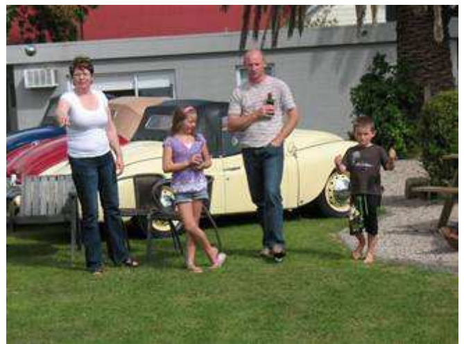
Family team in petanque