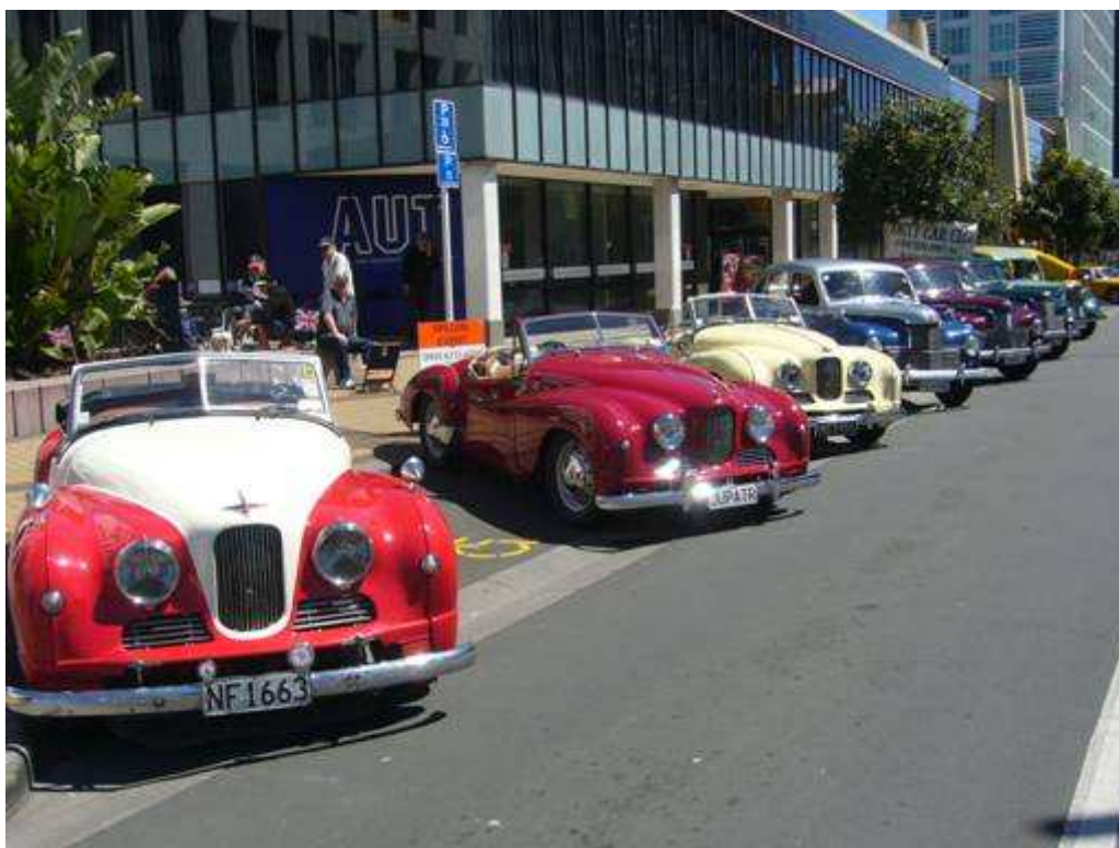
Jowetts at British Car Day

If you don't know the significance of Motat, it is just that it is the Northern Branches goal to get 20 Jowetts at a Branch meeting. Motat is in February and 2010, the centenary year of 100 years of production of Jowett cars could be the year to do this.