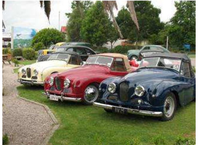
On display on Main St